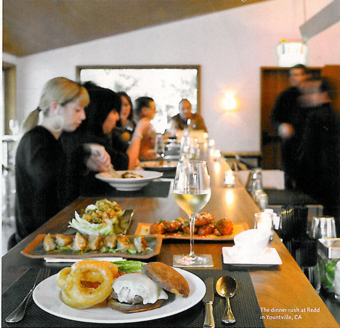
The dinner rush at Redd in Yountville, CA

At fancy restaurants, we're starting to think the hottest seat is at the bar—the menu is often less pricey, the wines by the glass tantalizing and unusual, and, thanks to the bartender banter (and eavesdropping), it's entertaining to boot. Plus, a pile of Monterey sardines or a tall craft beer just tastes better at the bar, where food tends to come out faster. Dig in.